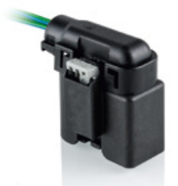
Shape E for very tight installation space with front cable outlet (flat cap)